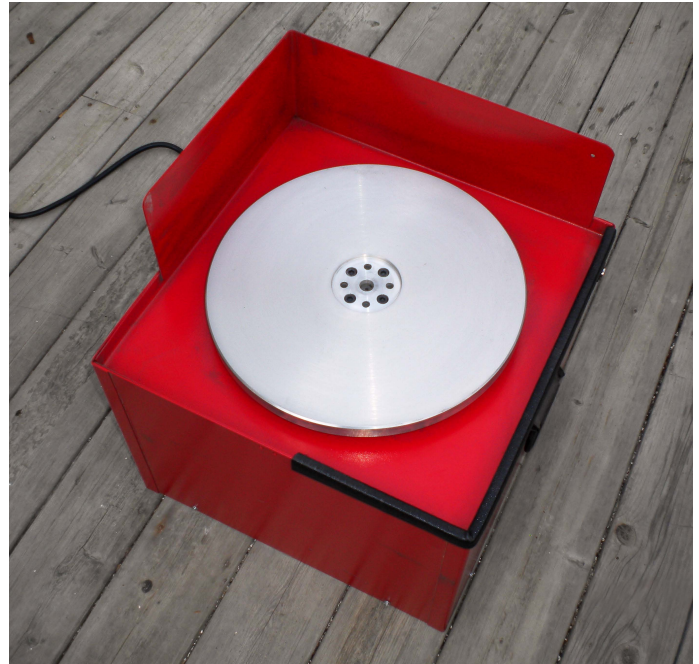
Nebraska Clipper Hone

FREE pick up & delivery within the service area